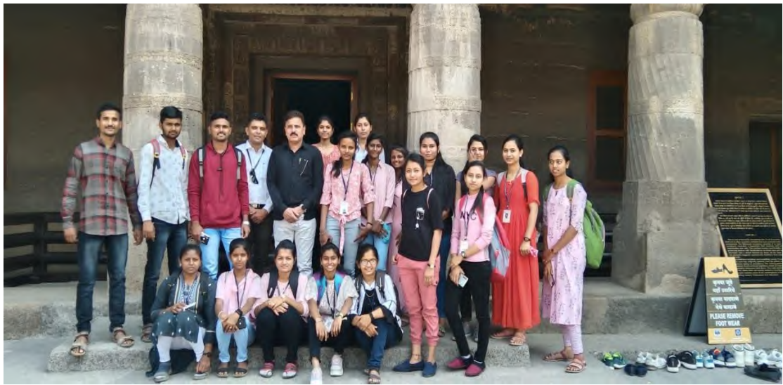
Study Tour At Ajantha Caves