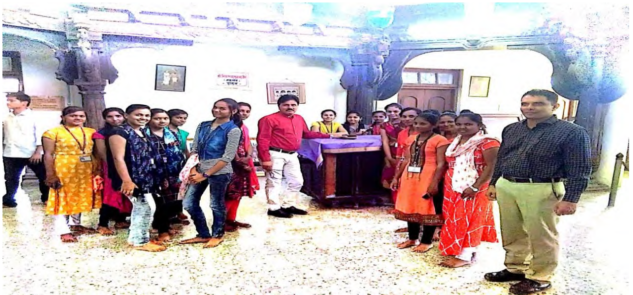
Study Tour At Rajwade Sanshodhan Mandal Dhule